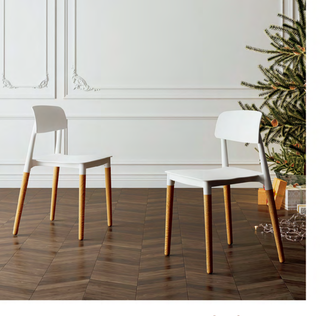
Santang | item 3022