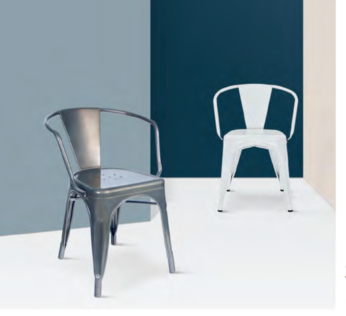
Santang | item 1517