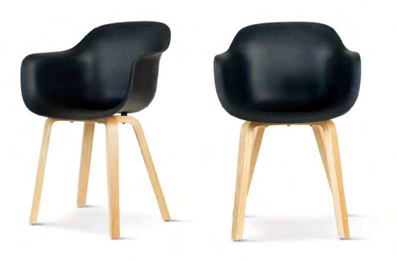
Santang | item 3048