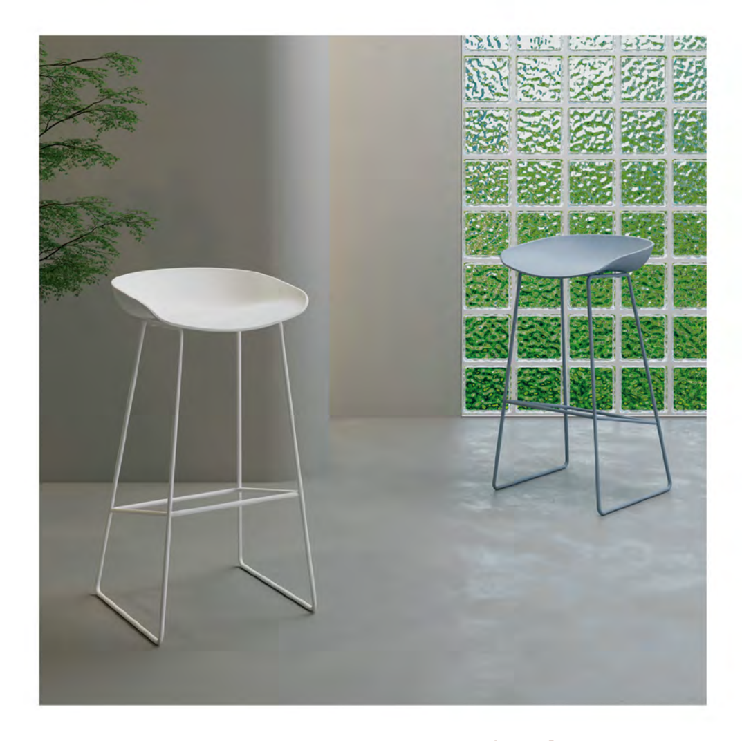
Santang | item 3021