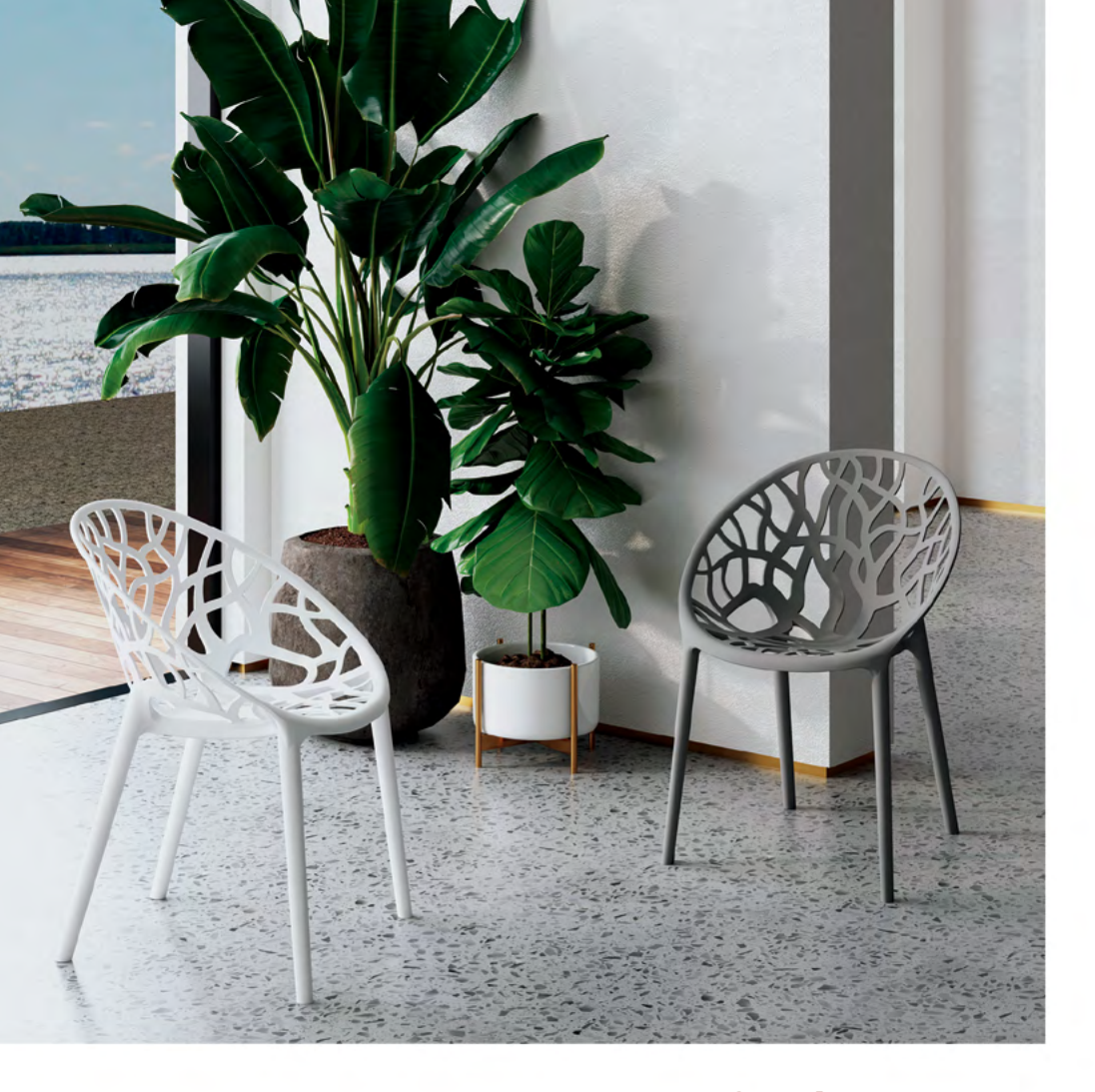
Santang | item 3018