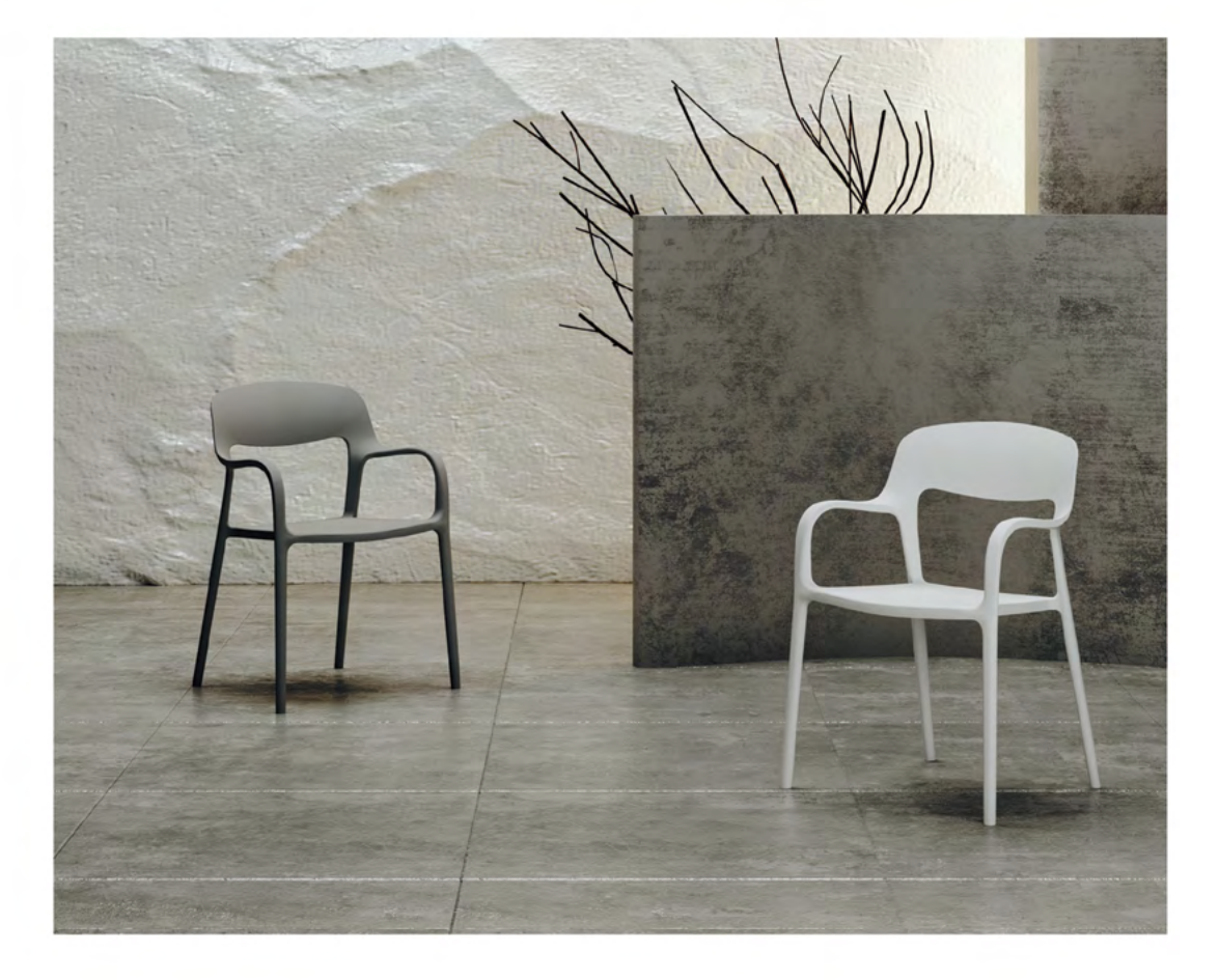
Santang | item 3027