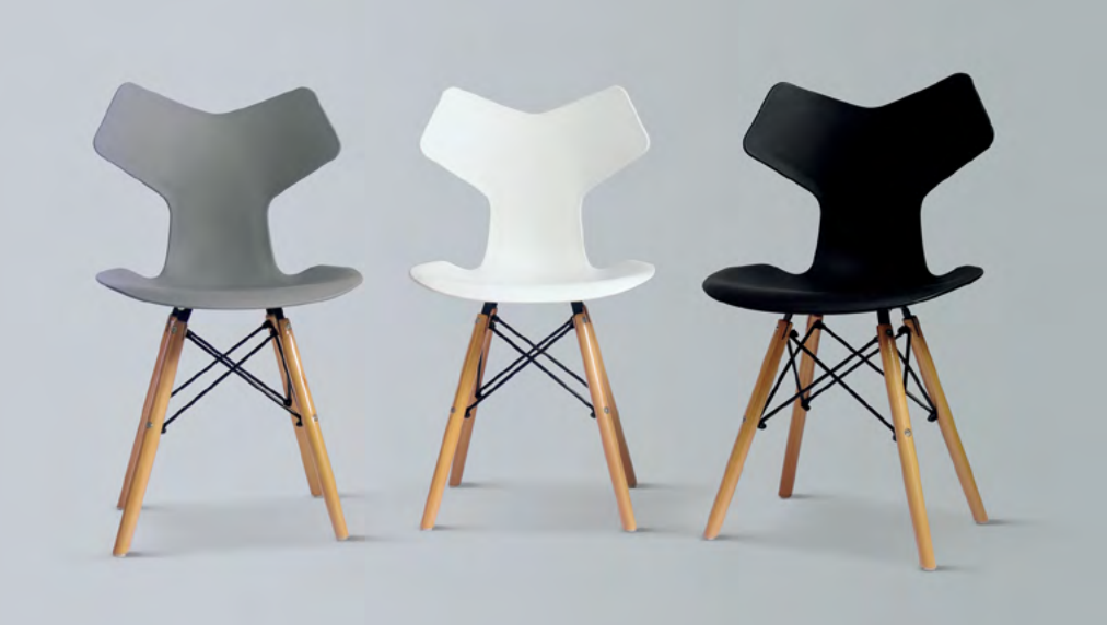
Santang | item 3050