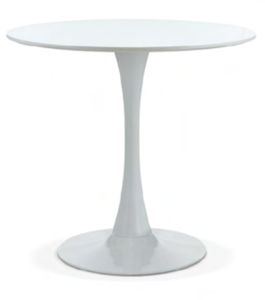
Santang | item 3036 Table