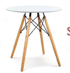
Santang | item 3037 Table