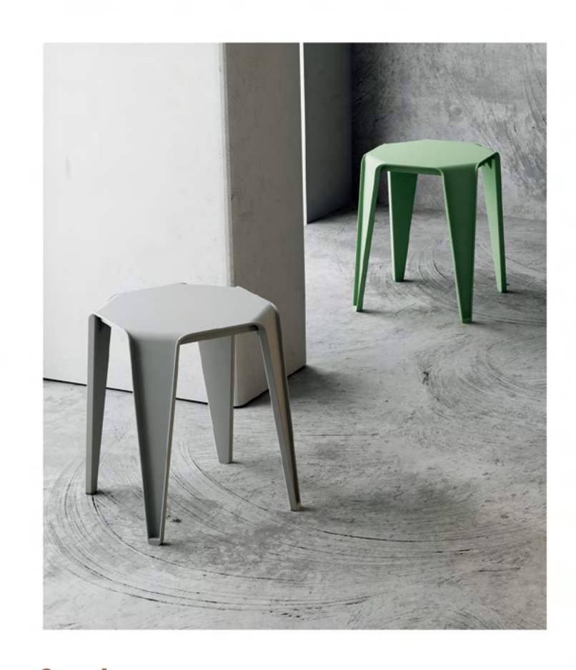
Santang | item 3006